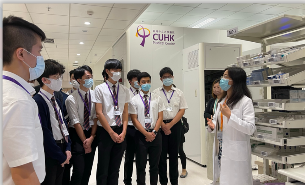
CUHK Medical Centre Visit