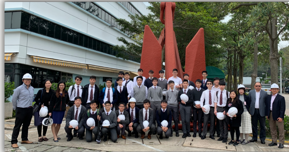
Visiting the Government Dockyard

The Careers Team assists students in their process of career planning and in gaining industry insights and work experiences through the CFC x DSOBA Mentoring Scheme, Diocesan Apprenticeship Program, Diocesan Thematic Workshops, career visits and life planning workshops.