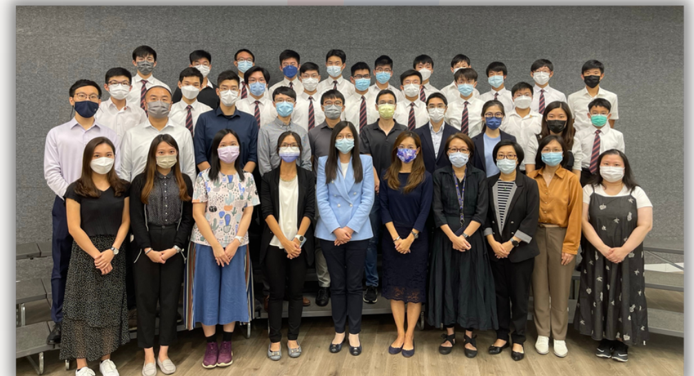
Ambassadors & Counsellors

For students who are interested in joining us, check out the CFC Website for further details!