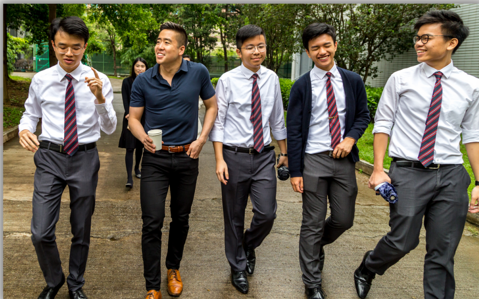
School Tour with Yale Admissions Officer