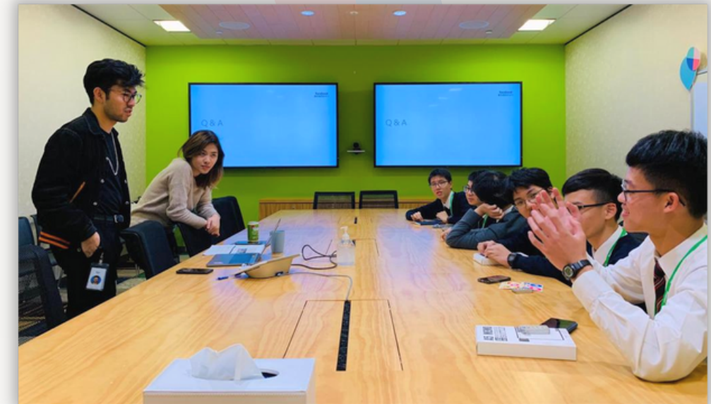
Hong Kong Facebook Office Tour

G10-G12 students can join our internship and job shadowing opportunities provided by the Diocesan Apprenticeship Program and external organisations. These internships enable students to identify their abilities and academic / career interests. Job opportunities are available for students' reference on our website.